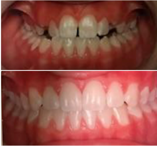
Figure 1. Subject before and after fixed orthodontic treatment at 11.5 and 13.5 years of age.

The etiology of Class III malocclusion is multifactorial and involves different genes and environmental factors. Different chromosomal locations and genes have been associated with Class III malocclusion in different ethnic populations [2]. Family studies also support a polygenic multifactorial inheritance pattern, as 13% of siblings of subjects with Class III malocclusion also exhibited Class III malocclusion [4]. Other studies analyzing twins have found that the rate of mandibular prognathism in monozygotic twins is six times higher than dizygotic twins, also suggesting polygenic inheritance and etiology [4]. However, pedigree analysis of Class III malocclusion in families has followed an autosomal dominant Mendelian pattern of inheritance with incomplete penetrance in a majority of analyses [2]. The conclusion of many of these studies is that Class III malocclusion within families is explained by some dominant gene being inherited in an autosomal dominant pattern, while likely be-