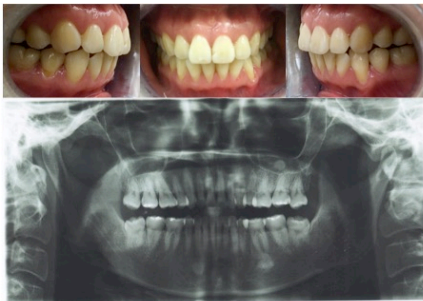
Figure 2. Intraoral photographs and panoramic radiograph. It is evident that the patient has bone loss from canine to canine in the mandible and mild bone loss on the right maxillary central incisor and left mandibular canine on the intraoral photographs. In the panoramic radiograph, evident bone loss is seen at both maxillary and mandibular anterior teeth.

progression of gingival recession on the mandibular anterior teeth.