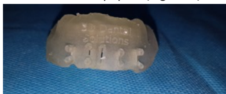
Figure 2. 3D piezo-surgical guide.

In the test group, piezocision surgery was performed on the same premolars extraction day to minimize the number of anesthesia depending sessions in terms of patients' comfort and satisfaction. After local Infiltration was injected (lidocaine hydrochloride 2% with epinephrine 1:80,000), a pre-customized 3D surgical guide was placed to perform vertical interproximal micro-incisions (varying between 5 and 8 mm) below each interdental papilla (Figure 2).