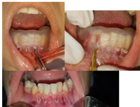
Figure 3. The guide is in place to perform the incisions and piezocisions.

The incisions began 4 mm below the papilla to prevent any further gingival recessions, then corticotomies (5 mm long and 3 mm deep) guided by the same 3D guide were made using a piezoelectric device (Implant Center™ 2, Satelec, France) with a BS1 cutting tip and irrigation solution pump 80 ml/m (Figure 3).