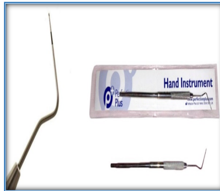
Figure 2. The CPITN-E probe.

examination, which involved evaluating the periodontal health status using CPITN. The results showed that 13.5% of students had a healthy periodontium, 17.5% had bleeding on probing, and 65.5% of them had calculus. Additionally, 3.5% and none of students, respectively, had pocket depths of 4-5 mm and 6 mm or more.