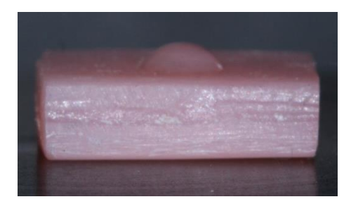
Fig. 2. Denture base specimen with 10 microlitre drop of human saliva.