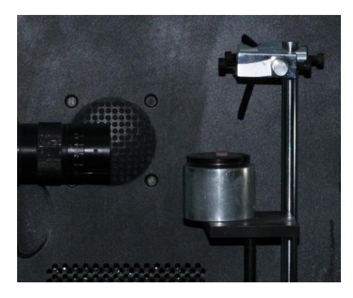
Fig. 1. Contact angle goniometer.

The same procedure was repeated for all specimens (heat cure resin and CAD-CAM) with all the four test groups of liquids.