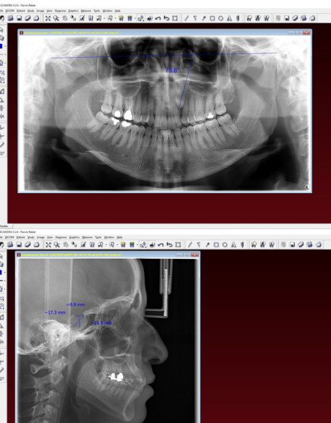
Figure 1. Two views of SCANORA version 5.2.6 software showing how to measure variables of Interclinoid distance, sella turcica depth, anteroposterior diameter of sella turcica bridging and canine angle

turcica (the longest distance between the tip of the tuberculum sellae and the posterior contour of the sella), sella turcica bridging and canine angle. The SCANORA 5.2.6 software was used to conduct measurements. The line drawn from the highest point of the condyles was used to compute the canine angle. (Figure 1)